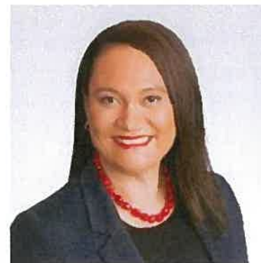
Hon Carmel Sepuloni

As the Minister for Disability Issues, I am committed to building a more inclusive and accessible society and ensuring disabled people have the same opportunities as other New Zealanders. That's why I am pleased to release this annual report on implementation of the New Zealand Disability Strategy 2016-2026.